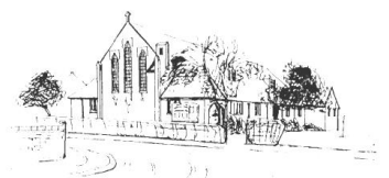
St Hugh's, Haycroft St

If you have any items to go in next week's newsletter, email admin@grimsbyminster.co.uk or ring the office on 01472 277277