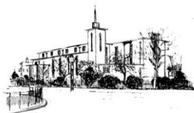
St Martin's, Sutcliffe Ave