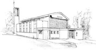
St Mark's, Laceby Rd

9.20am Morning Prayer, Grimsby Minster 5.30pm Evening Prayer, Grimsby Minster