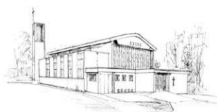
St Mark's, Laceby Rd