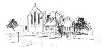
St Hugh's, Haycroft St

If you have any items to go in next week's newsletter, ring the office on 01472 277277 or email admin@grimsbyminster.co.uk we look forward to hearing from you.