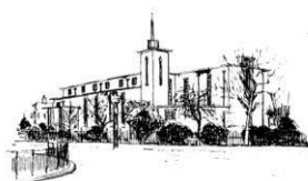
St Martin's, Sutcliffe Ave